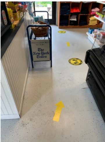
O Country Store marked for social distancing and traffic patterns