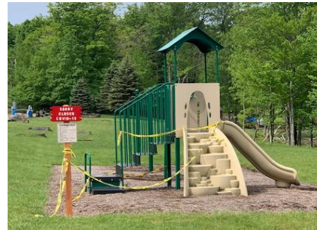
F Playgrounds remain closed until Monday, June 8th.