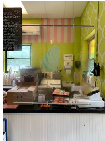
P Protective barriers have been installed at the Country Store