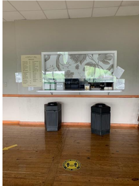
H Plexiglass has been installed at pick-up window for Henry's orders