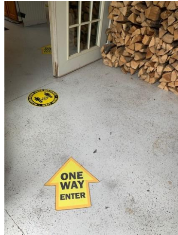
N Country Store marked for social distancing and traffic patterns