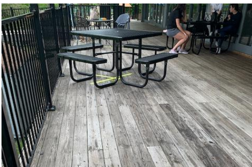
K Picnic tables are set on markers for social distancing - please do not move tables