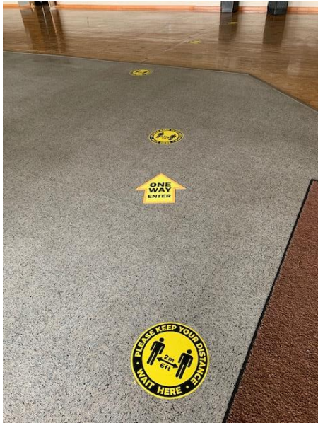
G Arrows and social distancing markers in the Clubhouse for Henry's order pickups only