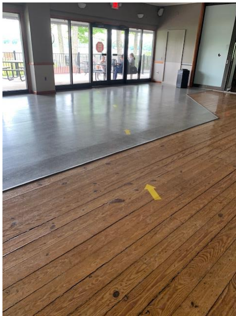
I Arrows indicating exit traffic from Henry's pick-up orders