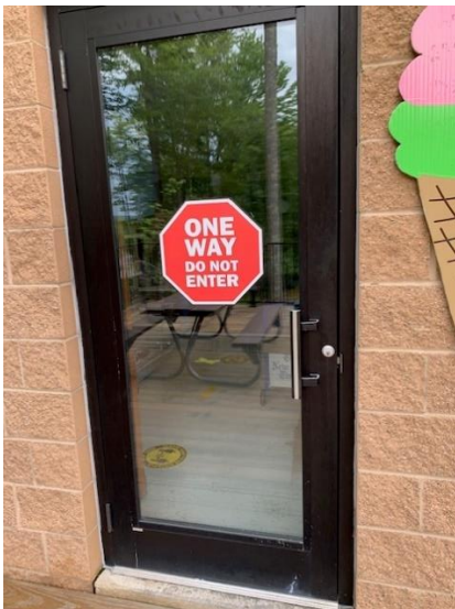
Q Traffic patterns posted at the Country Store to enter the front door and exit the side door