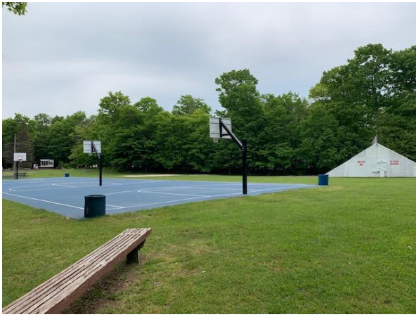
A Basketball courts with social distancing signs posted at handball courts.