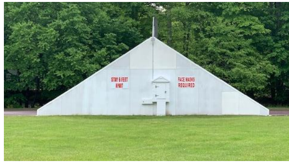
B Signs at handball courts