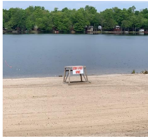
D Sign at Beach II