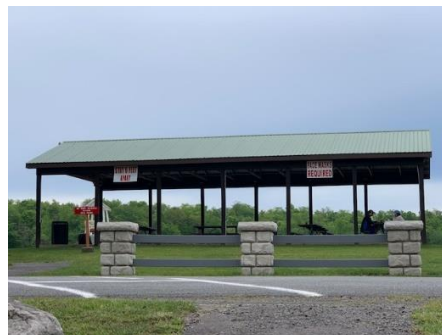
L Social distancing and masks required signage at the pavilion at Beach 1