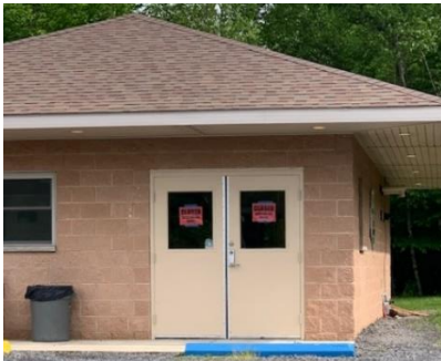
E Warming Hut Laundry Room remains closed