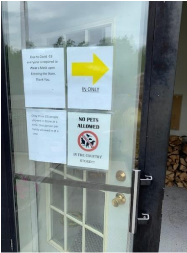
M Country Store entrance marked for one-way only traffic