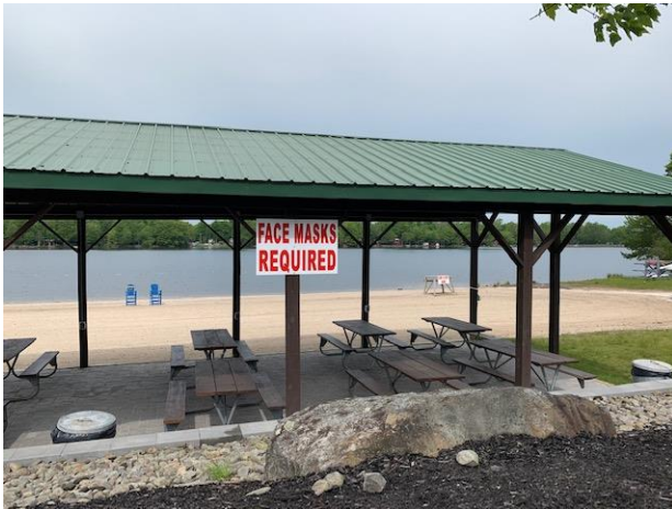
C Pavilion at Beach II